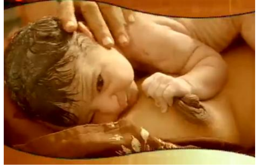
Image used with permission from UNICEF Maharashtra, Prashant Gangal, "Initiation of Breastfeeding by Breast Crawl", 1 st edition, 2007.